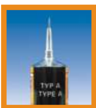
Tube Type A