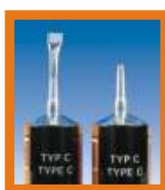
Tube Type C