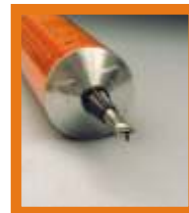
Tube Type T